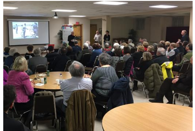
Introductions at the February 2018 Book Launch